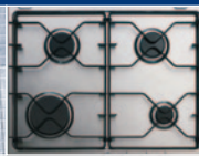
European stainless steel gas hot plate and electric oven