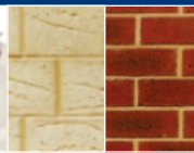
Your choice of either 1 course or 2 course face brickwork