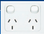
Double power points throughout (not single)