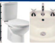
China basins, toilet pan and cisterns (not plastic)